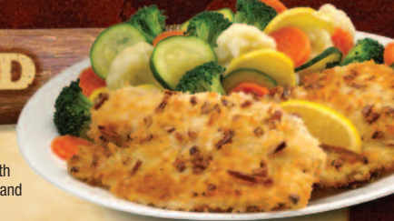
Pecan Crusted Tilapia

Pecan Crusted Tilapia Seared Tilapia filets crusted with seasoned panko breadcrumbs and chopped pecans. 13.49