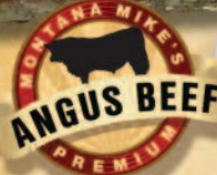
Applewood Bacon Sirloin